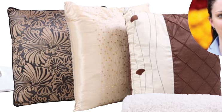
Bargain City; Barstools $39.95 were $59.95, 40cm x 40cm assorted cushions $9.95 each