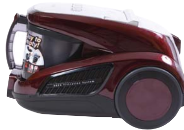
The Vacuum Shop; Samsung Twin Chamber $599, PIRANHA Force $299