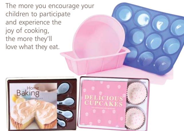
Angus & Robertson; Delicious Cupcakes Tin $14.99 (storage tin, 96 page recipe book, 4 measuring spoons), Home Baking Tin $16.99(storage tin, 80 page recipe book, cupcake cases). Silicone Bakeware from Prices Plus; Cake pan $3.99, Loaf Pan $3.99, Baking mat $3.99, Muffin pan $6.99

The more you encourage your children to participate and experience the joy of cooking, the more they'll love what they eat.